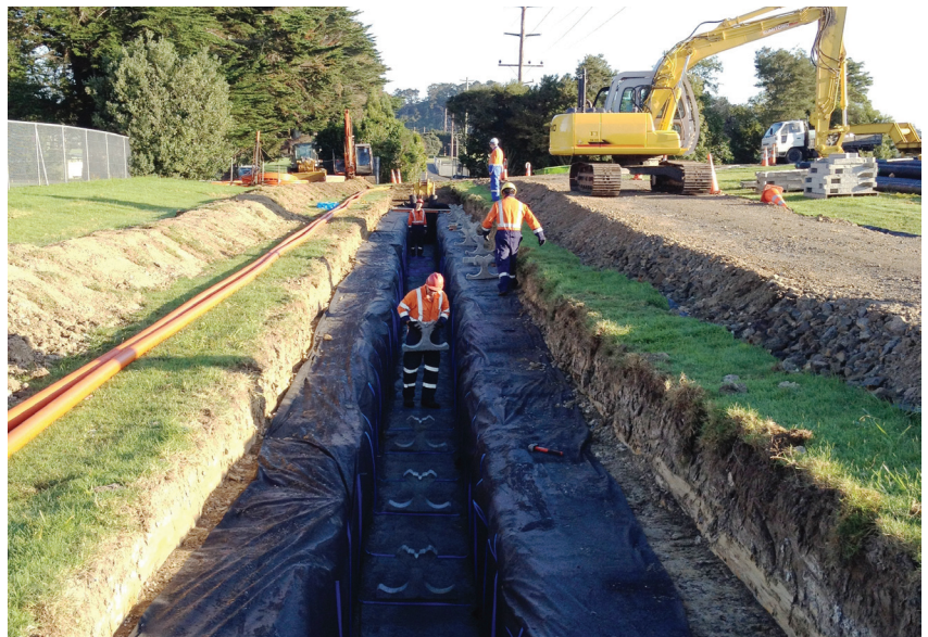
Trenching work in Watercare

An additional crew has joined our team to carry out trenching work. They are currently working in Watercare and council land area between Jack Hinton Drive and Upper Harbour Drive. You may have noticed an entranceway has been created from Upper Harbour Drive to allow machinery and vehicles into the area. Please take care when driving past the entranceway as trucks will need to slow down before entering.