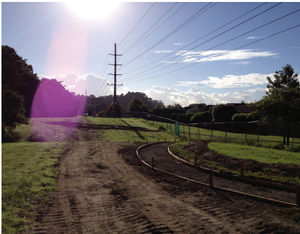
Footpath reinstatement Northwood Reserve

Short sections of the haul roads and joint bay pits will remain in place in both reserves to allow access for the cable pulling expected to start in June. Final reinstatement and any required tree replanting in both reserves will be done after all work in these areas is completed.