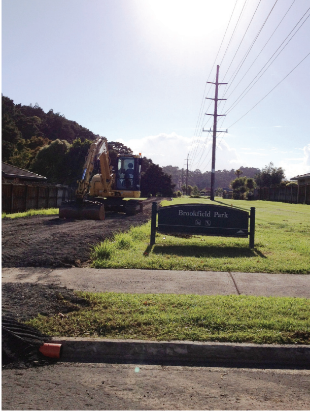
Haul roads under construction in Brookfield Park

Haul roads are being constructed in Brookfield Stream Reserve between Vanderbilt Parade and Stanford Street in preparation for trenching work. We expect to cross Vanderbilt Parade in late March and Stanford Street in late April.