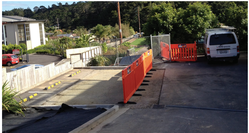
Reinstatement work at Rosedale Plaza

We have excavated a trench in the western side of the car park at the plaza which affects the car park entrance – please use the entrance on the eastern side while work is ongoing. Work is progressing well through this area, with reinstatement already underway.