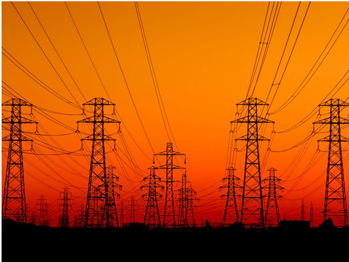
Figure 5-1: Existing lines as they converge at Islington substation

Our analysis has shown that remedial measures, discussed below, are needed to improve the resilience of Islington substation to fire and earthquake risks and that an upgrade of the substation low-voltage AC supply is required.