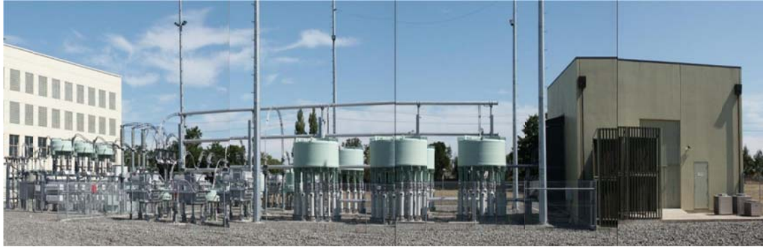
Figure 4-2: SVC3 at Islington

The estimated cost of the refurbishment is $11 million.