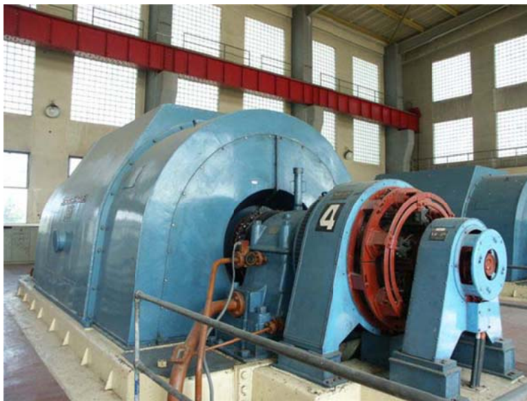
Figure 4-1: C4 synchronous condenser at Islington

The synchronous condensers have an inherent vibration characteristic. This is a source of nuisance to neighbours and as a consequence, the synchronous condensers are only run when absolutely necessary.